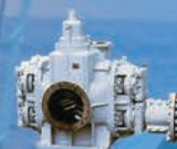
Gear Cargo Pump