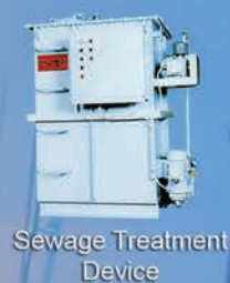
Sewage Treatment Device

Our marine equipment includes YANMAR Main Propulsion and Auxiliary engines; TAIKO KIKAI Oily Water Separator, Cargo Pumps, Engine Room Pumps; Sewage Treatment Plant; KASHIWA Fire Fighting Equipment, NAKASHIMA Side Thruster, Propellers and Shafting System.