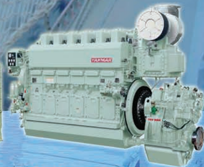
Main Propulsion Engine