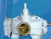
Two Screw Pump