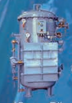
15ppm Bilge Separator