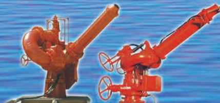
Fire Fighting System